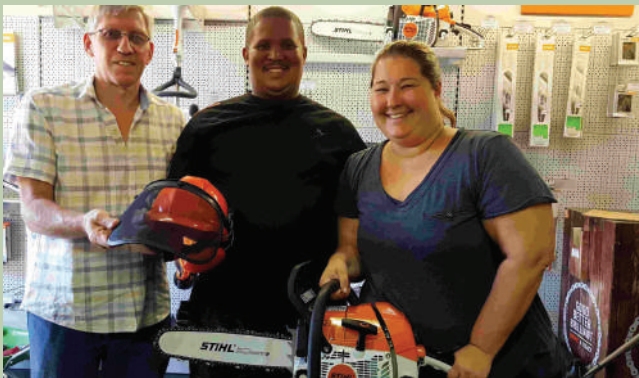
One of the entrepreneurs receiving goods