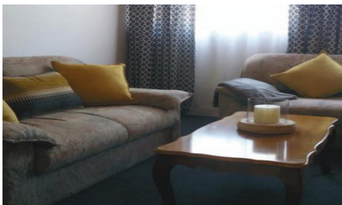
The counselling room